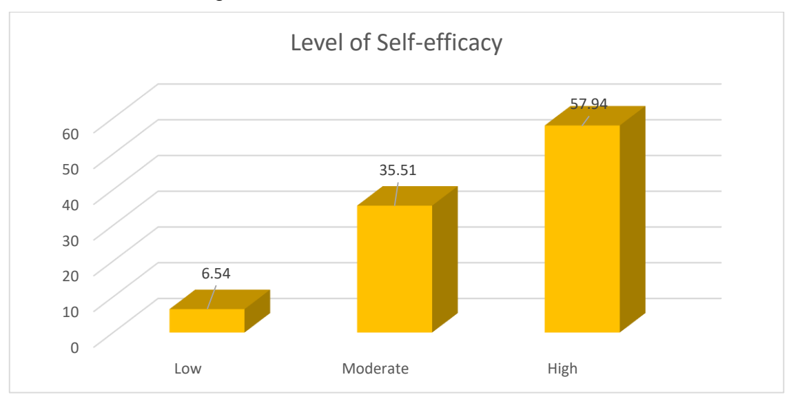
Figure 2: Percentage-wise distribution according to Level of Self-efficacy

Figure 1 illustrates the extent of Emotional Intelligence among the Nursing students. The data indicates that 69.46% of students possess a high level of Emotional Intelligence, while 23.85% exhibit a moderate level and 7.01% demonstrate a poor level of Emotional Intelligence.