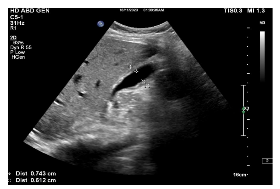
Figure 4: The ultrasound image of another patient with acute hepatitis (AST -697 and AST - 390) showing thickenedwall of gall bladder ( the anterior gall bladder measures7.4 mm and Posterior wall measures 6.1mm)