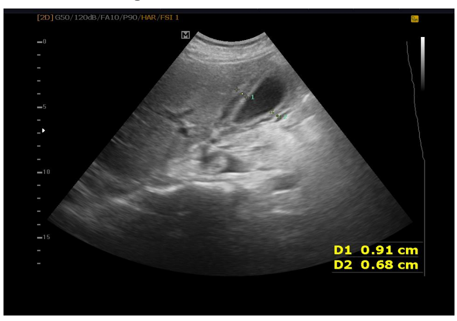
Figure 3: The ultrasound image of a patient with acute hepatitis( AST- 890 , ALT - 567) showing thickenedwall of gall bladder ( the anterior gall bladder measures9.1 mm and Posterior wall measures 6.8mm)