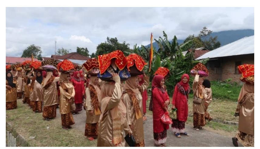
Image 4: Depicts the Procession of Carrying "Jamba" Conducted by the Local Women during the Event.

Image 3 shows an invitation used to invite several officials to attend the Bajamba Culinary Festival event held in the Padang Laweh village, Agam Regency, West Sumatra