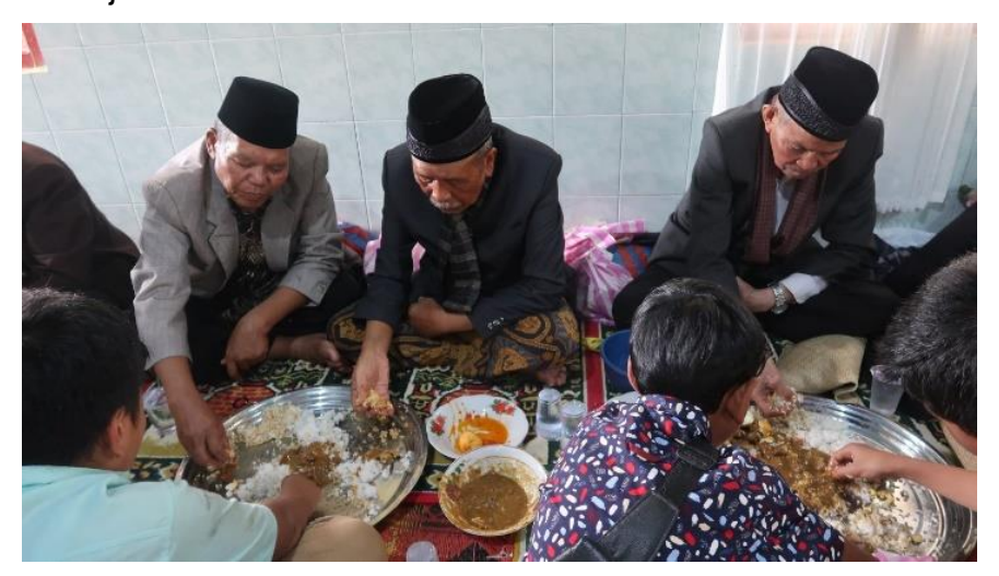
Figure 5: The Activity of Makan Bajamba is carried out by the Mens and Several Children.

In Figure 4, it can be observed that the women are wearing uniforms and carrying jambas covered with food covers. The community then follows a predetermined route in this procession. This is part of the parade or procession during the culinary festival called "makan bajamba" tourism festival.