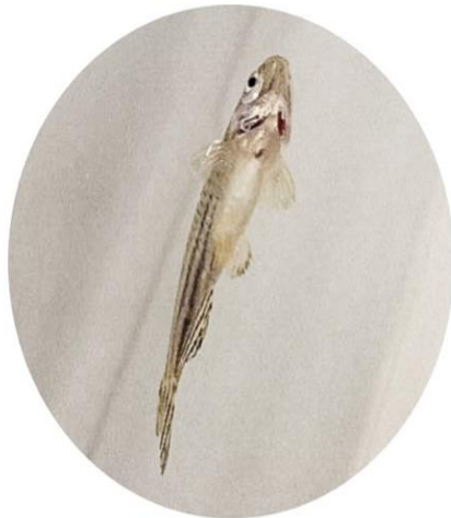
Figure 1: The intoxicated zebrafish rolls vertically prior to death