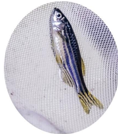
Figure 2: The intoxicated zebrafish's body surface darkened