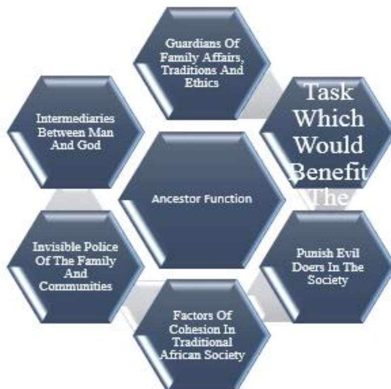
Figure 2: Functions of Ancestors

They are called upon to discharge certain task which would benefit the community especially when there is no one else to do it. E.g. among the Yoruba, when an Oba becomes unbearingly despotic, the Egungun would discipline such a despotic Oba at the Egungun shrine, Egungun also performs the important function of expelling undesirable element from the community. See the below diagram for clarity.