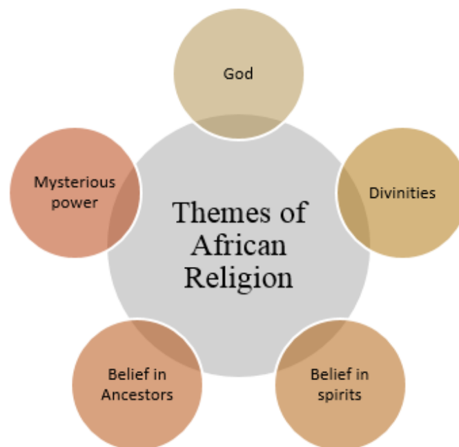
Figure 1: Structures of African Religion

Related to beliefs in Ọrìşà and ancestors is the belief in reincarnation. Reincarnation is the belief that the dead family members come back to life, as a new child into family where they previously lived. Many Yoruba are identified through resemblance, dreams or divination as being reincarnations of particular ancestors, and are given names such as Babatunde ('father returns') or Yetunde ('mother returns'). These ancestors are invoked to help their descendants. It is painful that African values are fast deteriorating and this trend is fomenting various kinds of disintegration among Africans. The young Africans are caught in this web of confusion and crisis of identity. Despite the efforts expended to rediscover these African values, a lot are still left unsolved because new problems and challenges arise and seemingly truncating any further progress. Thus, the themes or structures of African Traditional Religion could also be summarily and diagrammatically represented below: