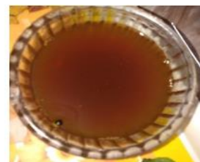
Figure 10: extract with all the ingredients