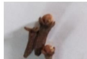
Figure 7: Syzygium aromaticum