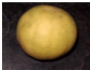
Figure 9: Citrus limon