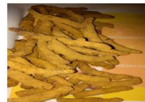
Figure 4: Curcuma longa