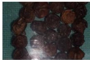
Figure 6: Piper nigrum