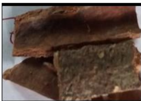
Figure 5: Cinnamomum verum