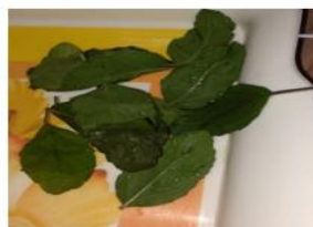
Figure 3: Ocimum sanctum