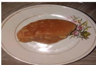
Figure 2: Saccharum officinararum