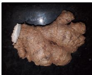
Figure 8: Zingiber officinale