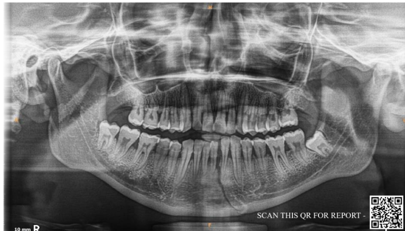
Figure 2: OPG of the Patient with QR code to open the Report