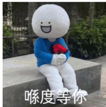
Figure 2: Emoticons“喺度等你”

2 conveys the meaning of "waiting for you here" in Cantonese through the image of a waiting person. This emoticon not only demonstrates the grammatical structure and expression of the Cantonese dialect, but also reflects the cultural tradition of the people of the Cantonese-speaking region, who are hospitable and emphasize interpersonal relationships.