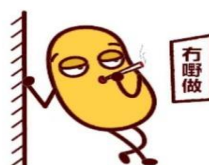
Figure 1: Emoticons“冇嘢做”

These linguistic elements not only enrich the connotation of emoticons, but also make them closer to the life and culture of local people. For example, some unique Cantonese words and phrases are combined with images and words to form emoticons that are easy to recognize and understand. These emoticons not only convey specific emotions and messages, but also demonstrate the unique charm of the Cantonese language. For example, the emoticon "Waiting for you at 喺度" in Figure