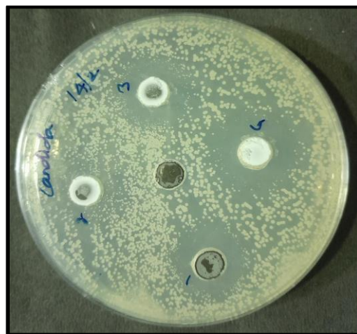
Figure 1: Antimicrobial activity of candida albicans Herbal Nanoformulations of cinnamon bark and leaf essential oils (CBE0 and CLE0)

The study's findings showed that, in comparison to the positive control, ketogluconate, the herbal-synthesised nanoparticles had a considerably greater antifungal activity against Candida albicans , as evidenced by a bigger zone of inhibition in the fourth well. This demonstrates the exceptional effectiveness of the nanoparticles in preventing Candida albicans from growing, suggesting them as a viable alternative treatment option for fungal infections linked to tooth caries. Furthermore, the structural features of the nanoparticles were identified by scanning electron microscopy (SEM) examination, which showed a distinct broccoli-like appearance. The visual appeal and scientific interest of these fascinating nanoparticles are enhanced by their structure. Overall, these results provide insightful information on the potential of herbal nanoformulations as potent antifungal medicines, indicating that more research and development should be done to address dental issues associated with Candida (32–33).